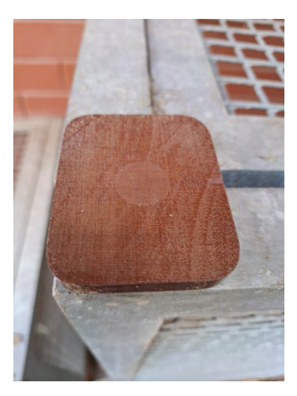
Mallet head end piece found at Hutt Road. Is your mallet missing something?