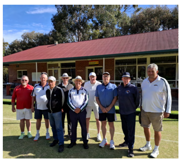
Nine participants in the Men's Singles