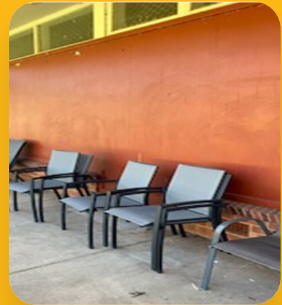
South facing wall of the club

Aerial view of facility (shelter sheds face north)