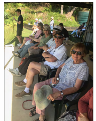
South Australian supporters