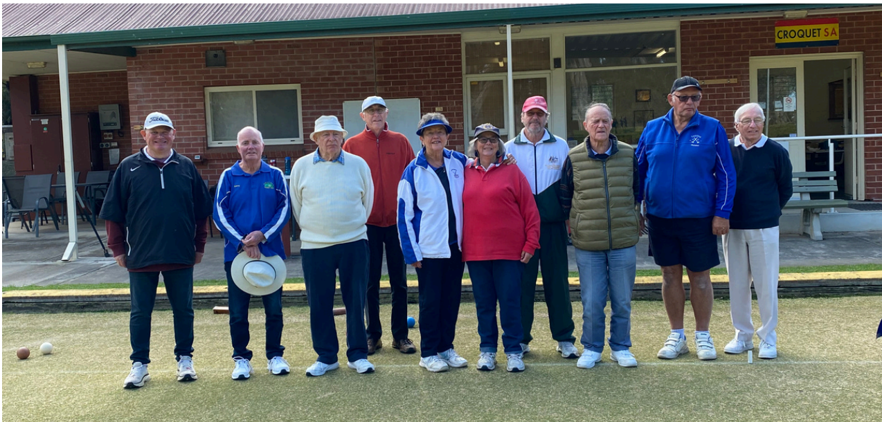
Division 2 singles participants