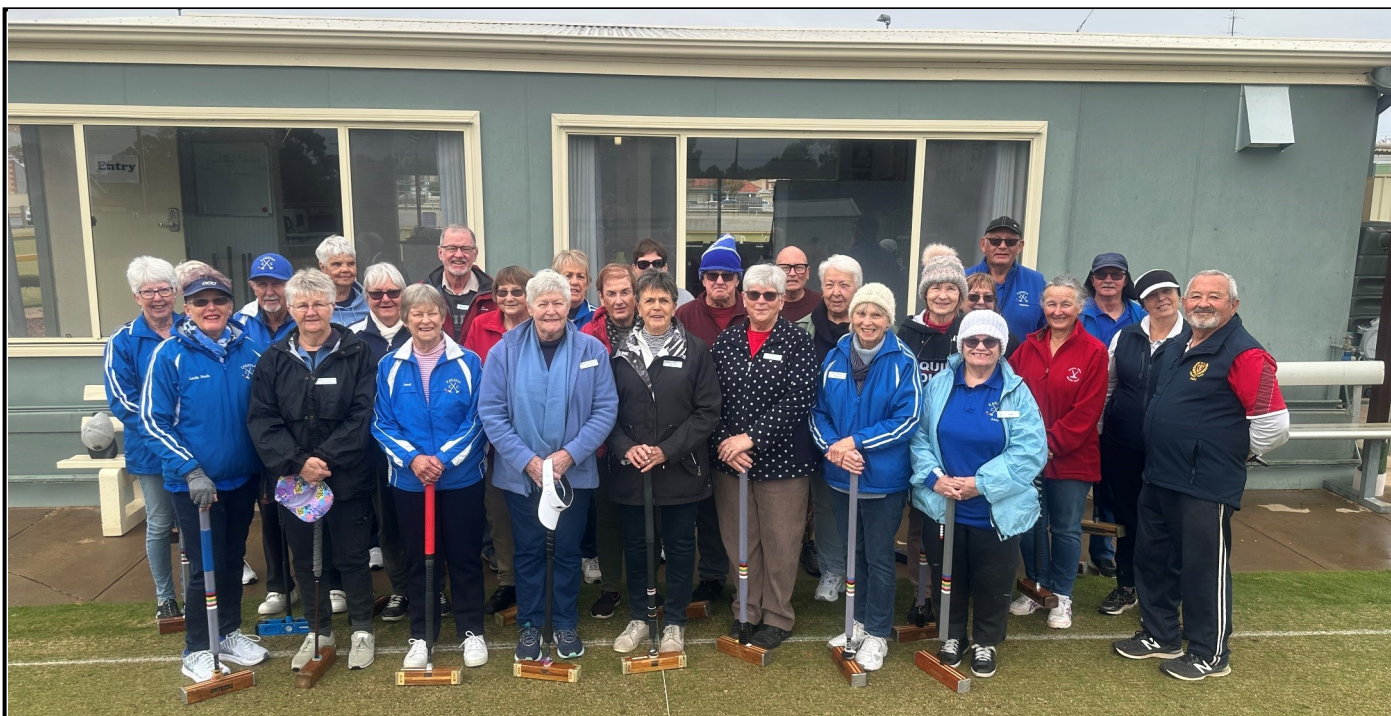
Players from the Northern Yorke Peninsula and the North Western Croquet Associations